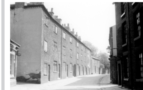
Woodside Lane looking towards Woodfold, demolished in January 1960.

Woodside is one of the largest and most visible sites the Council will release to developers. To ensure that in future Woodside reflects the community's needs, the team organised the Burngreave New Housing Project Group to discuss what should be built there, using the Cabinet agreed Masterplan as a starting point. Membership of this group is now closed but we hope to provide reports in the Messenger.