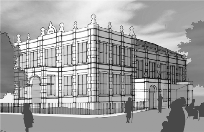
Artist's impression of how Vestry Hall will look.