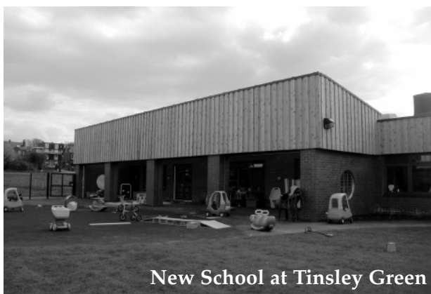
New School at Tinsley Green

Colleagues in CYPD are all too well aware of the school closures in the area, and the scale of replacement, for example, at Pye Bank School. But the scale of the problem has changed quite rapidly. Burngreave and Fir Vale have experienced a population increase, which contrasts with what has happened across the rest of the city, where pupil numbers have declined significantly over the past eight years. The area used to have difficulty letting some rented housing; nowadays there are very few vacants. And more families are living in the area than previously – all of which is a sign of a revival of confidence. But the downside