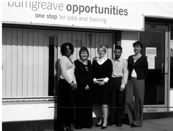
The Burngreave Opportunities team.

If you would like to find out more about this project, then please call the team on 0800 0730727.