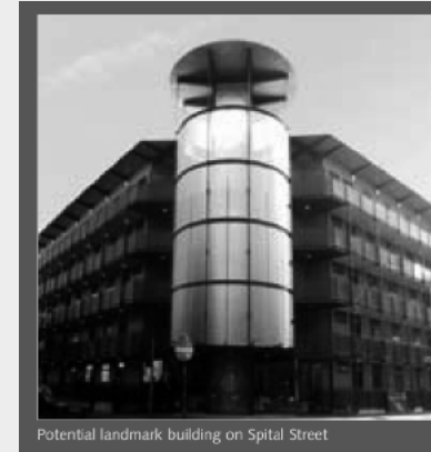
Potential landmark building on Spital Street

pedestrianise the shopping section of Ellesmere Road. This he believes will cause a drop in trade for many businesses there. "Maybe it should be a car park to service the shops and that indoor food market, which I think is a great idea."