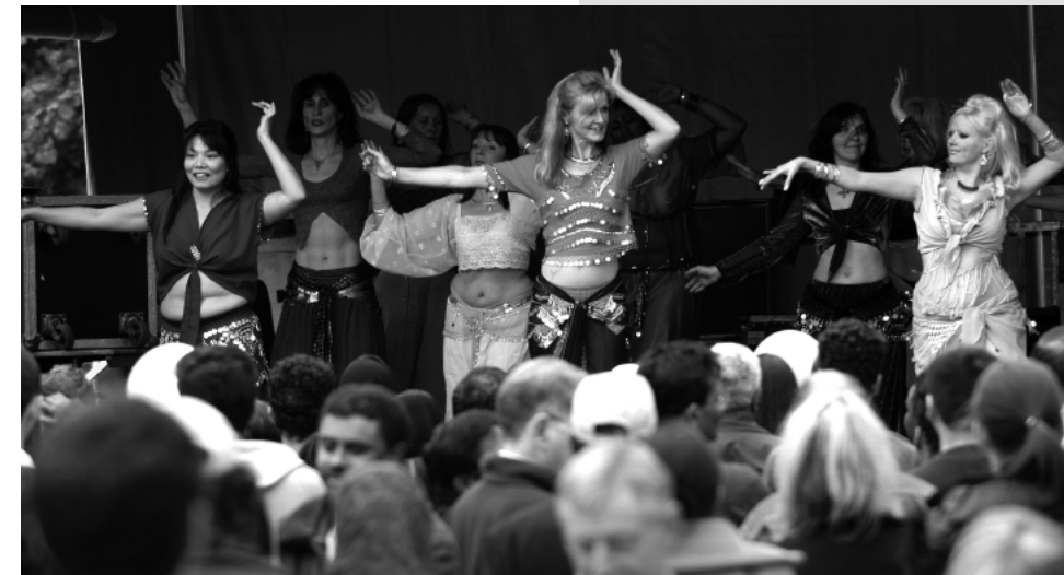
A snapshot of the 2004 Abbeyfield Festival.

Burngreave needs a place to relax, celebrate, acknowledge each other and have fun together. Having highlights in