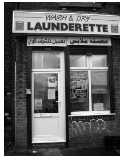
Situated 3-7 Ellesmere Road.

Large highly-polished and clean industrial tumble dryers and washing machines line the interior of the premises. "People can do their ironing here and, unlike some places, can come and do just that and dry clothes if they want," added Fatima. Ellesmere laundrette is also an agent for St Mathew's dry cleaning services. So for any further information on all material washing facilities and dry cleaning services call Fatima on 275 6277.