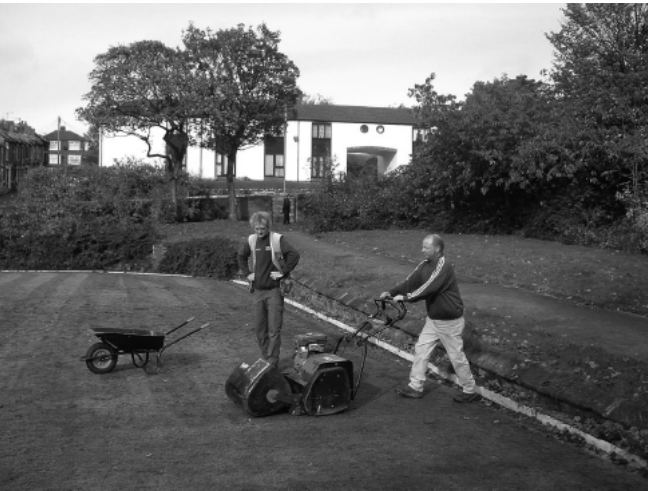
Work begins on the bowling green.

For more information about the work contact Bereavement Services 239 6068 or visit the Friends of Burngreave Cemetery and Chapel any Sunday 11am–3pm at the Chapel. – [ed]