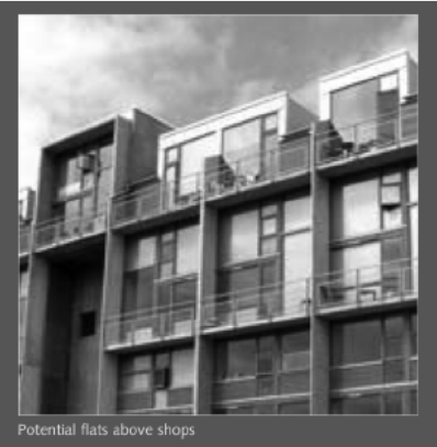
Potential flats above shops