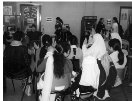
Funding for SEKNA Women's Day