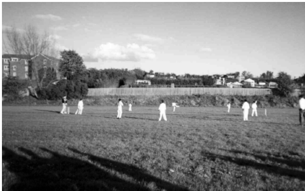
Support to the Burngreave Junior Cricket Team

Our fourth round of Community Chest grants is now available. We accept applications from groups within Burngreave and Fir Vale for up to £200.00. Over the past three years we have given out grants to over thirty local groups to fund things as varied as play equipment, training, arts projects, youth activities, environmental improvements, support for small groups and celebrations that promote this area. The list is endless so if you have an idea and want to find out if your group is eligible or for an application pack call us on 276 9134. The deadline for this round is Friday, 1st October 2004 at 5.00pm. Payments will be made in mid October.