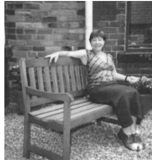
A bench for the Burngreave Domestic Abuse Project